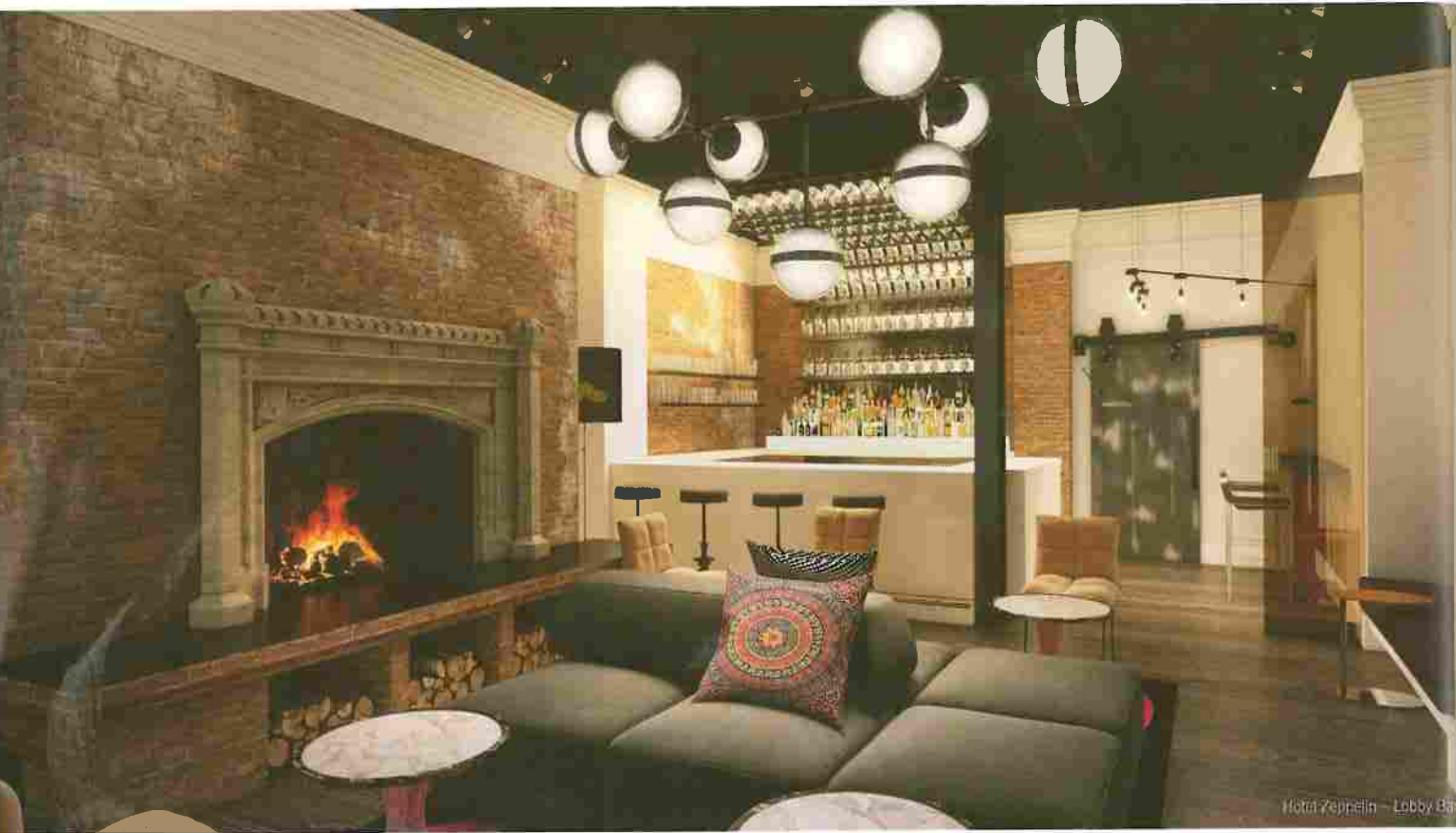
Hotel Zeppelin - Lobby Bar

International design firm reshapes San Francisco hotel market with new 'unofficial collection' of cross-branded hotels