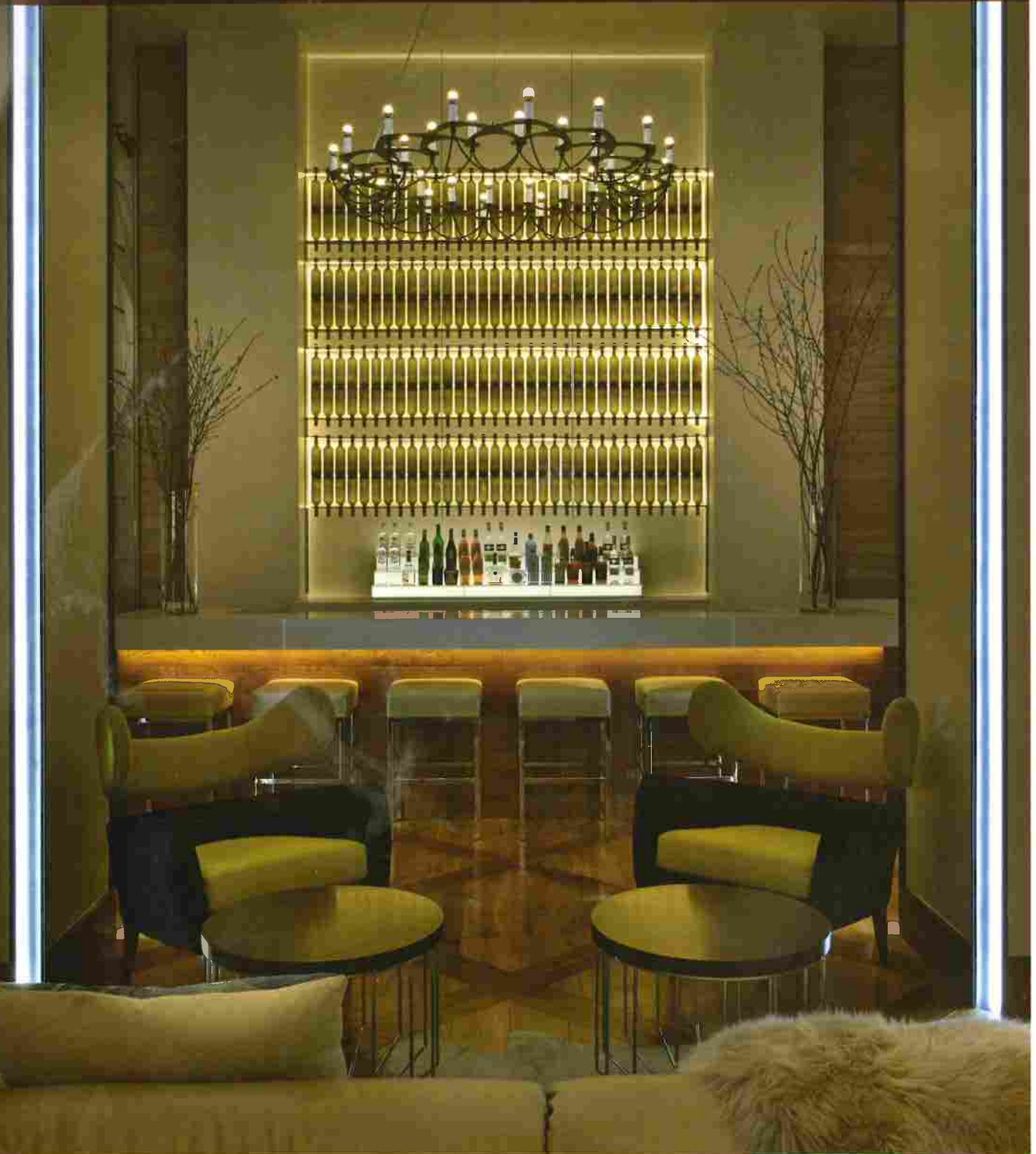
Hotel Zetta - Lobby