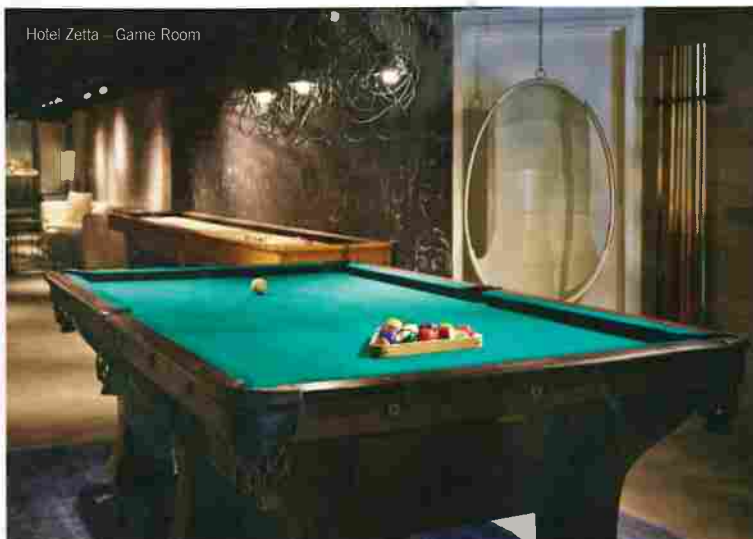
Hotel Zetta - Game Room