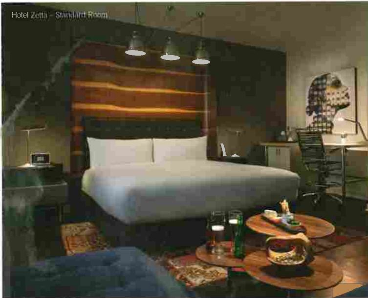
Hotel Zetta - Standard Room