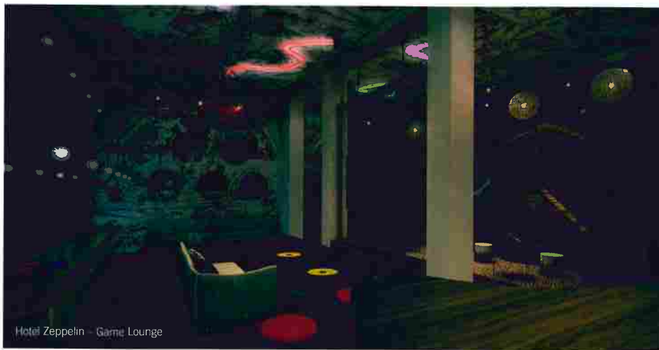
Hotel Zeppelin - Game Lounge