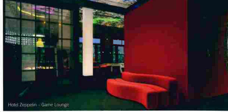
Hotel Zeppelin - Game Lounge

to a viceroy hotel and is expected to open in March 2016. Hotel Zetta was the first of the hotels, opening in 2013 and beginning the unofficial “z” collection.