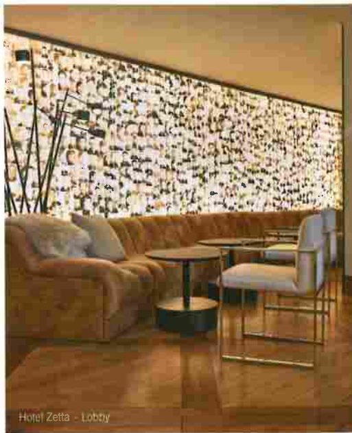
Hotel Zetta - Lobby